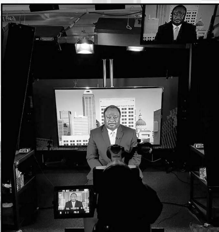
PHOTO: Preparing for a live interview on MSNBC, 2016